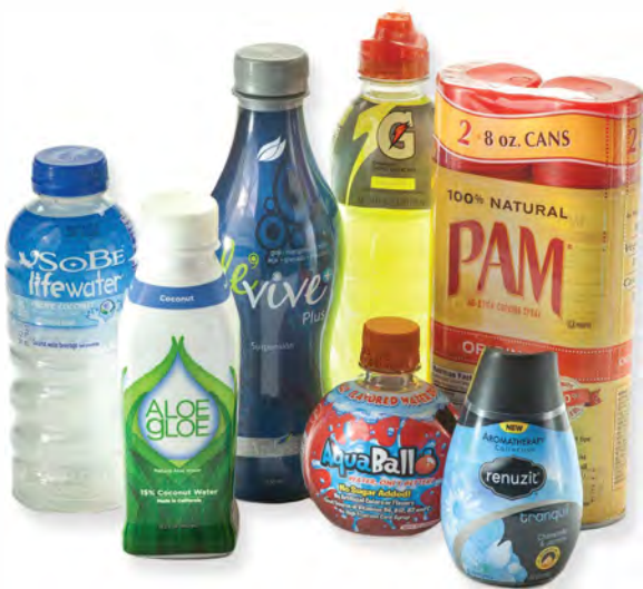
SHRINK SLEEVE LABELS